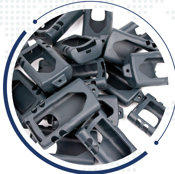
COVER made of silicone