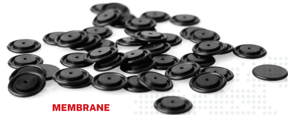
MEMBRANE made of EPDM rubber