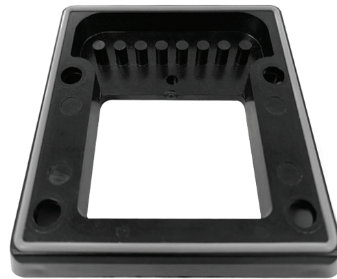
GASKET for electronic device